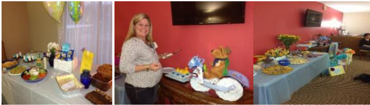
Wonderful food, decorations,