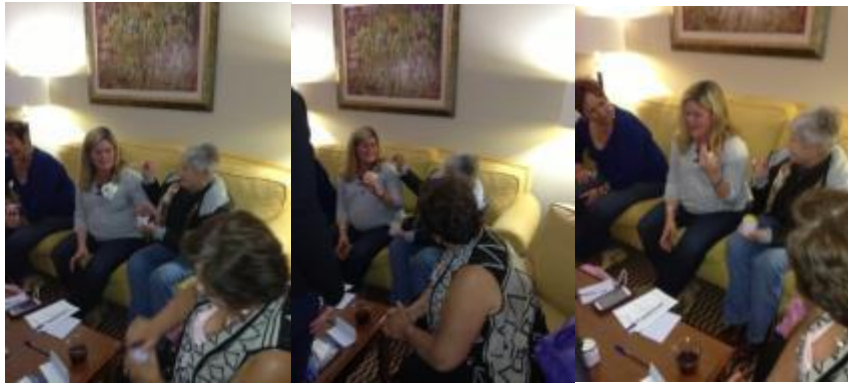
Games – guess the baby food flavor – ugh!